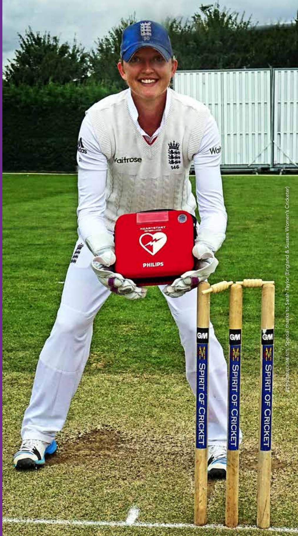
ACKNOWLEDGMENTS: Special thanks to Sarah Taylor (England & Sussex Women's Cricketer)

Every week 12 young people in the UK DIE due to undiagnosed heart conditions